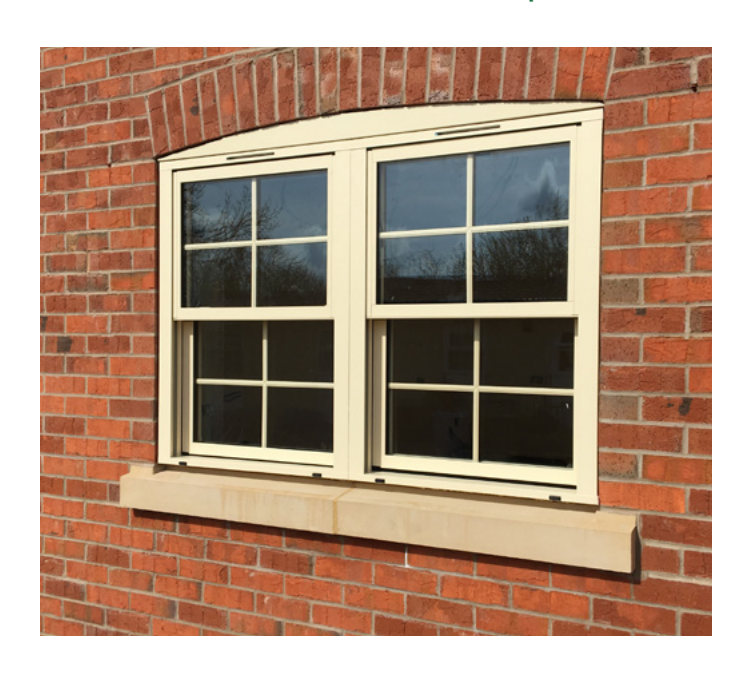
Vale Window System

Contact us today to see how we can help with your project, for a quote or for any further information.